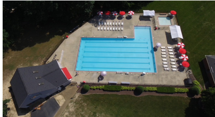
Aerial view of our pool

As a reminder, no live trees with a diameter in excess of five (5) inches, no flowering trees in excess of three (3) inches, no live vegetation on slopes of greater than 20% gradient, may be removed without the consent of the ARC. Removal of any tree or trees deemed a danger to any home will be approved if requested.