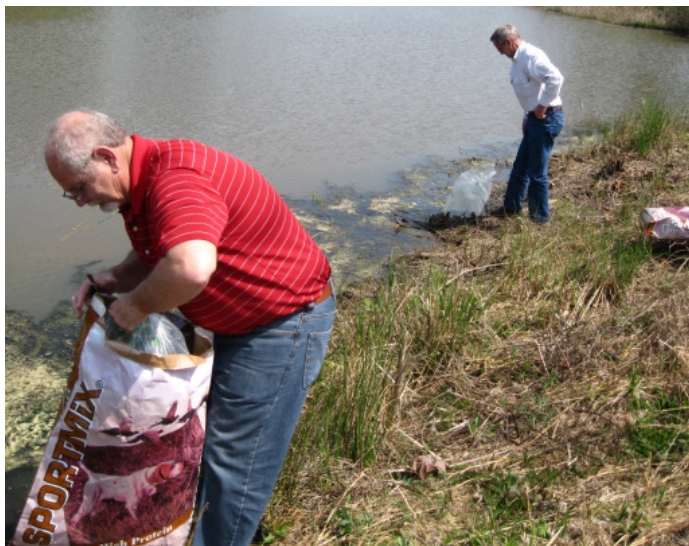
Carp release into ponds

TERMITES • COCKROACHES • FLEAS • TICKS • RODENTS