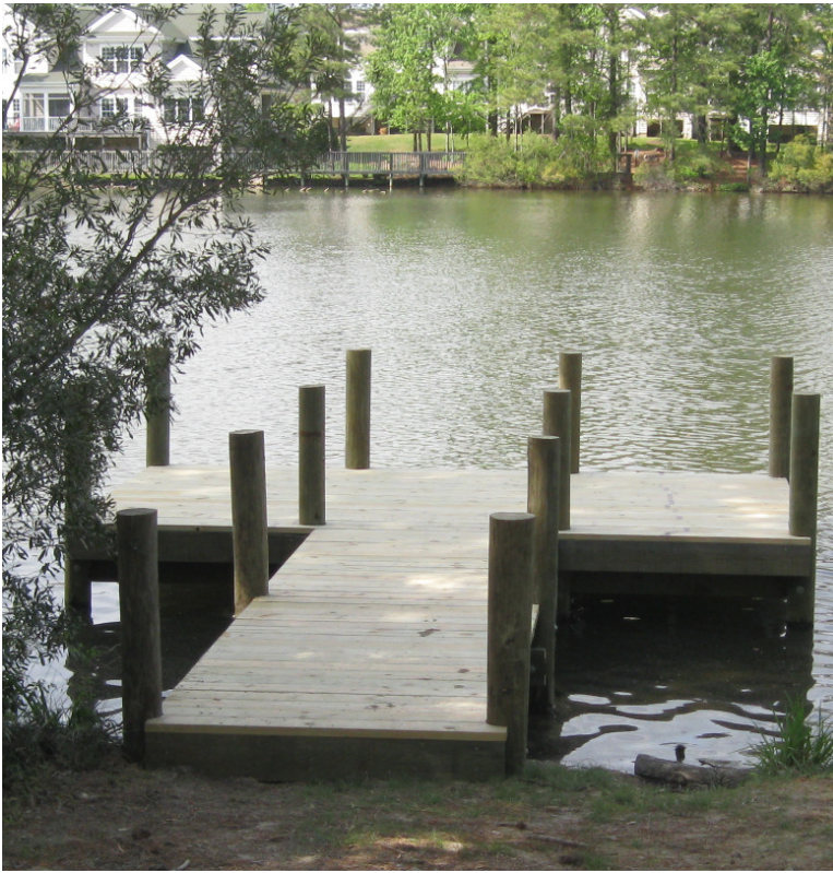
Piers at Rennick's Pond