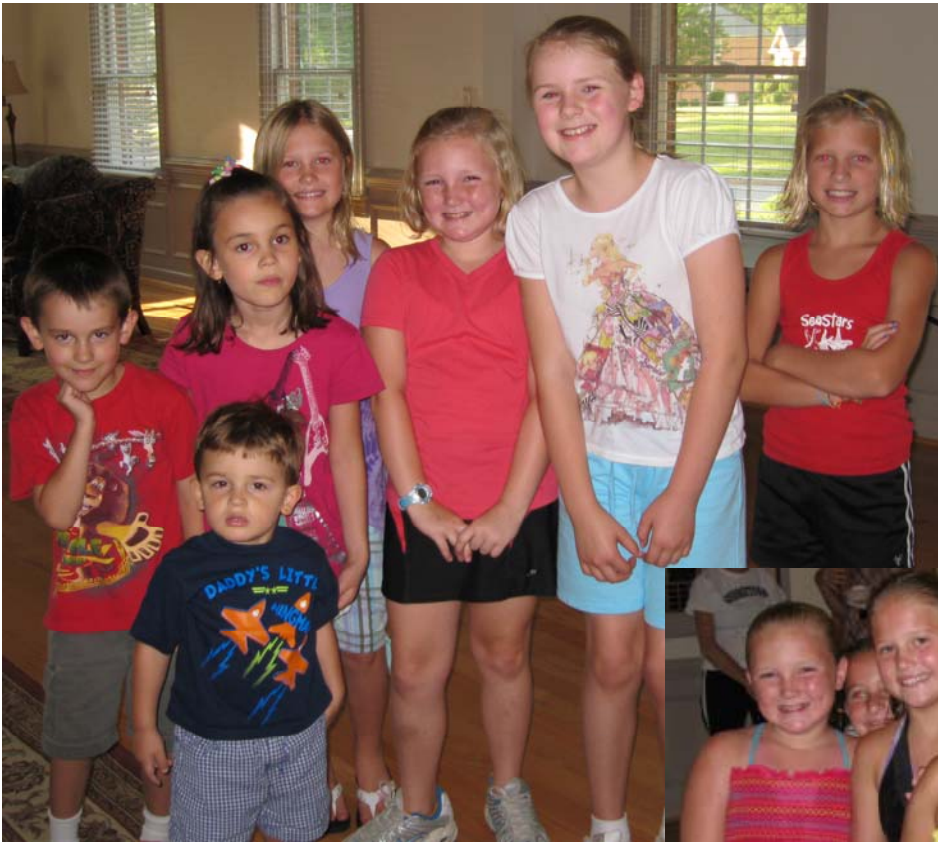
Ice Cream Socials –Summer 2010