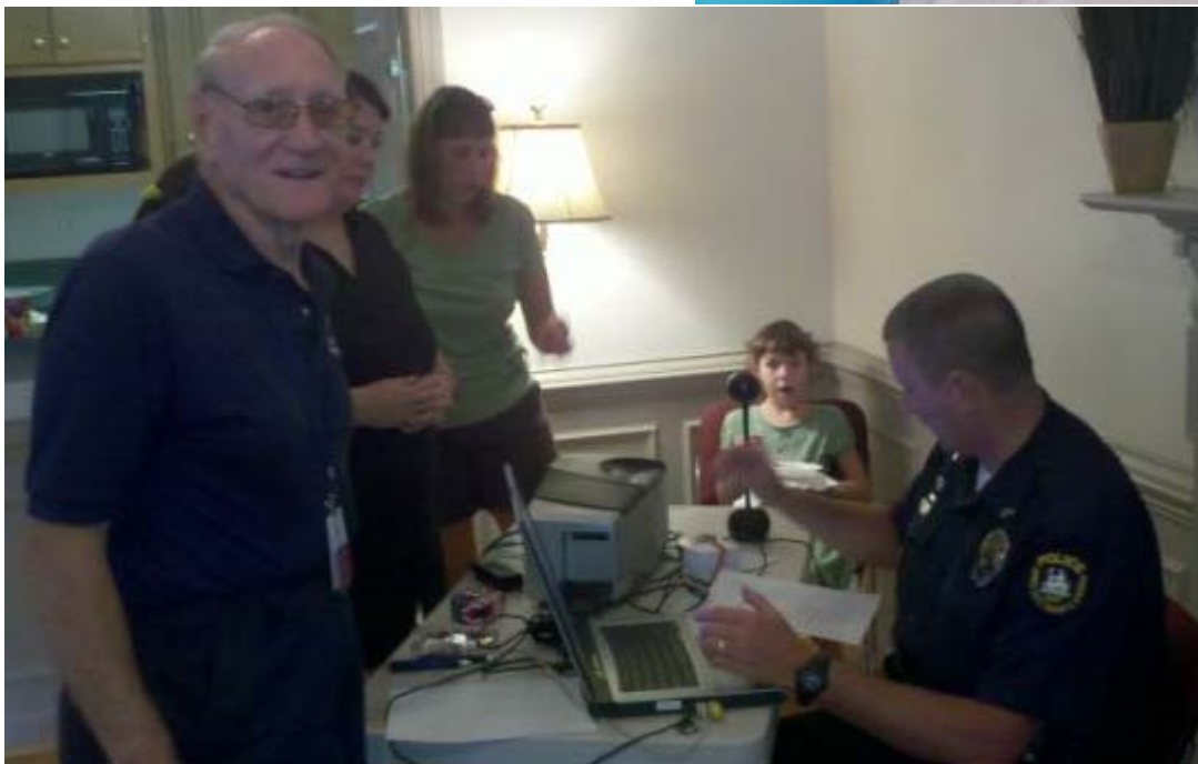
Identi-Kid Program offered by JCC Police during Ice Cream Social