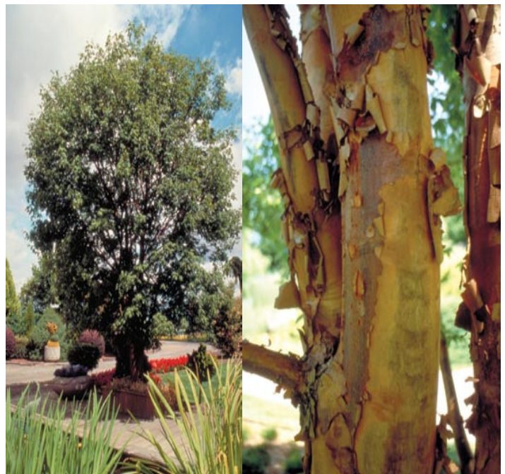
Paperbark Maple Tree

So come on neighbors, get out there and plant away!