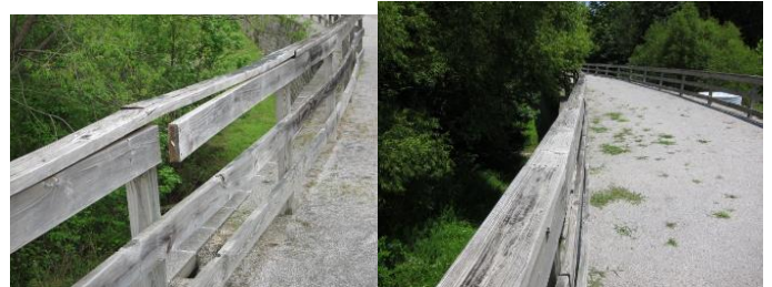
Fence Before Repair

Some of the boards in the fence on the Stacked Block Dam had warped and come off of the posts. They were reattached to the posts.