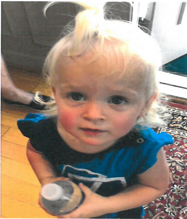
“One of our residents enjoying the day at the picnic”

Great fun was had by all with the delicious catered buffet, games and -a big hit on the hot summer day- use of the pool!