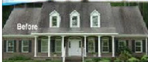
Before ROOF CLEANING