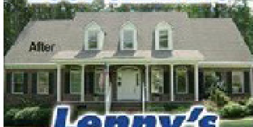
After Lenny's Power Washing