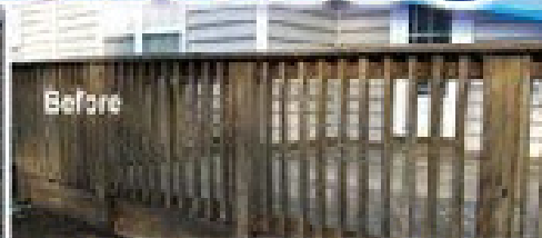
Before DECK RESTORATION