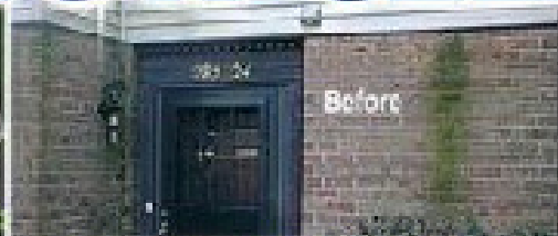
Before HOUSE WASHING